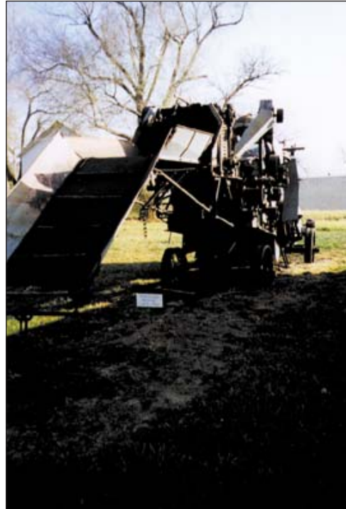
1925 Huber Threshing Machine

The horse drawn farm machinery, located on the east side of the museum building, was used from 1870 to 1930 in the breaking of the sod and building of farms in the Oketo community.